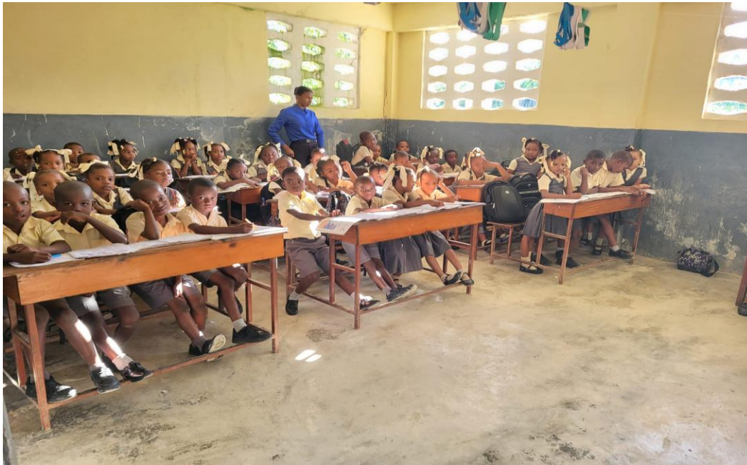
Figure 1: Ste Rose de Lima - Gris Gris

With sincere appreciation, The PTPA Team