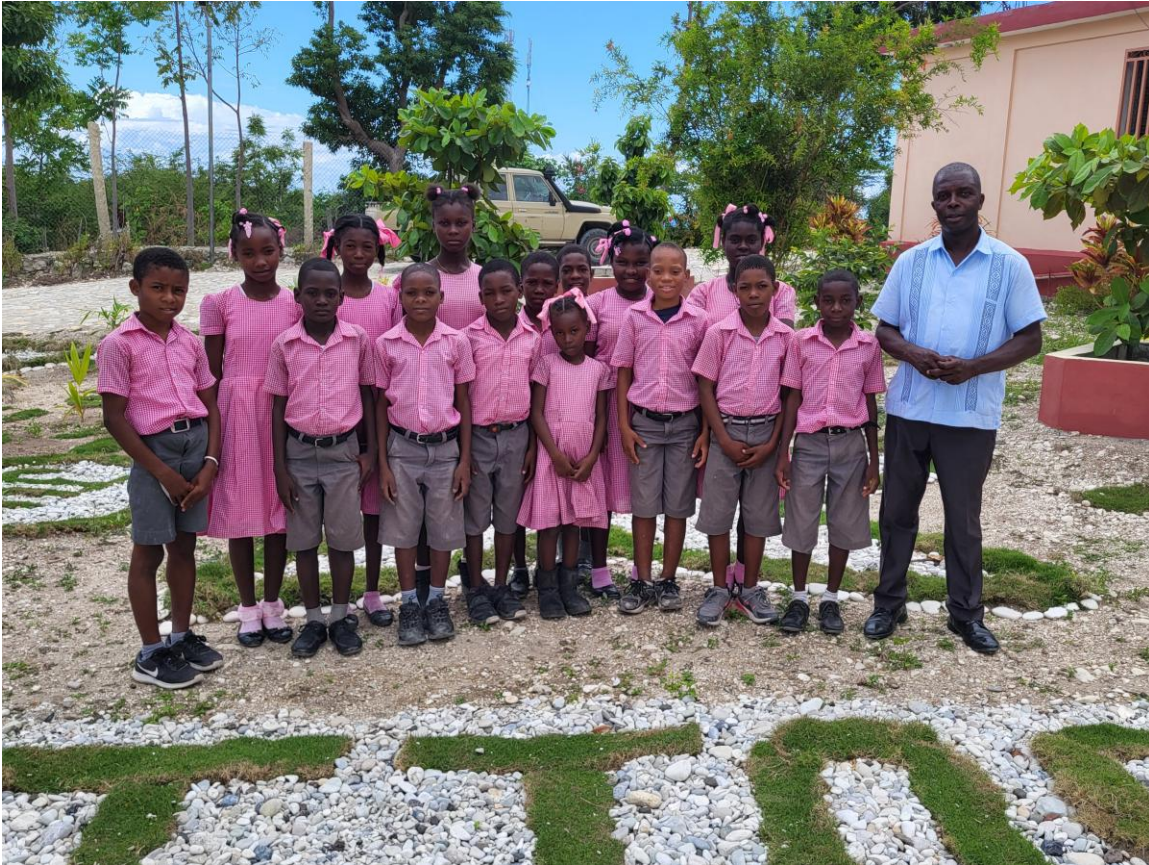
Figure 2: St Joseph Cotes de Fer